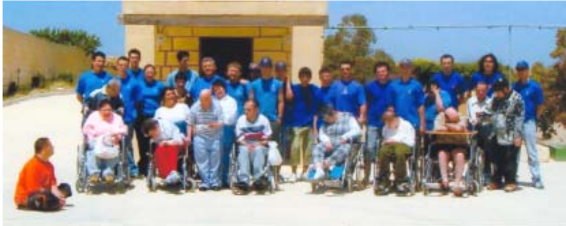
The Venture Scouts with the patients at Dar tal-Providenza